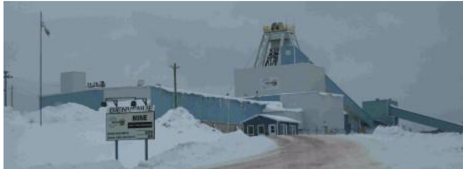
Bachelor Lake Mill on the Day of Site Visit

The following are excerpts from the recommendation offered and photos from their site visit: