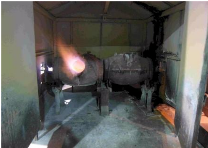
Gold Furnace at Bachelor Lake Gold Mill – site visit

...The company estimates Bachelor Lake will be in full production by the end of 2010."