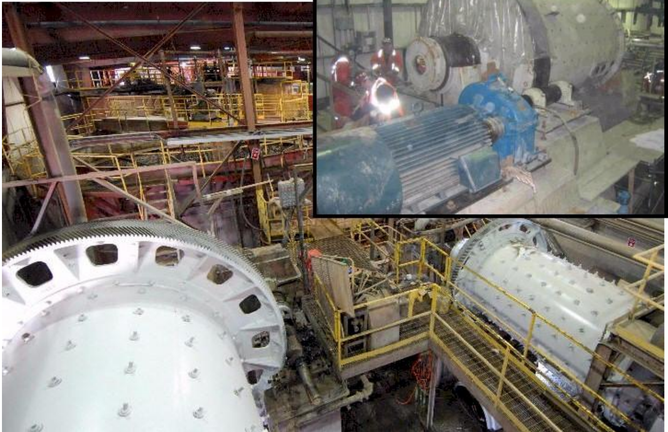
Upper inset photo: New rod mill – site visit Larger image: Photo of existing ball room operation