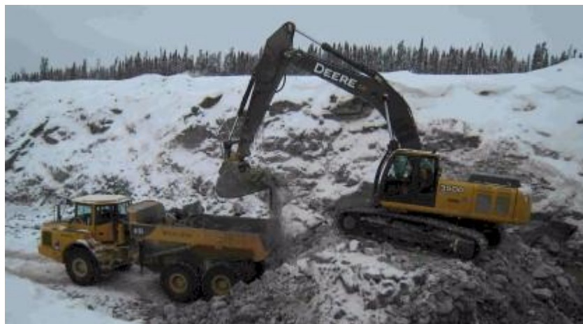
Barry Deposit – site visit